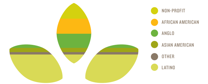
CUMULATIVE LOANS BY ETHNICITY (AS OF 12/31/2007)